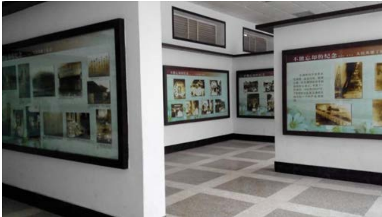
Fig. 1 Present Situation of Basic Indoor Display

As a character memorial hall, there are relatively few objects and supporting materials. How can Ding Youjun's short and glorious life be truly represented? Multiple utilization all the modern display tools is the key to solve the problem, but at present, the display devices are short, with display cabinets and panels as the main devices. Besides, there is a lack of audio-visual display means such as multimedia, projection, phantom imaging, scene restoration, sand table model, touch screen, etc. They make the visiting atmosphere less infectious, no participatory and no interactive, weakening the effect of publicity and education.